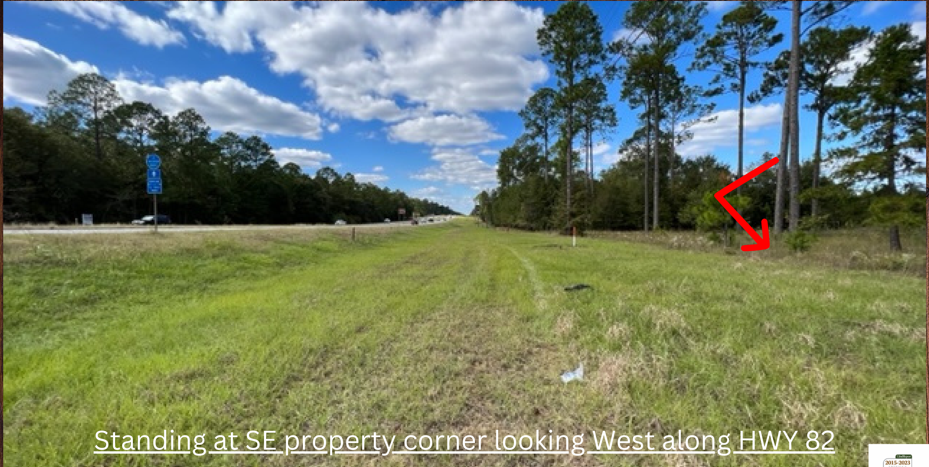
Standing at SE property corner looking West along HWY 82