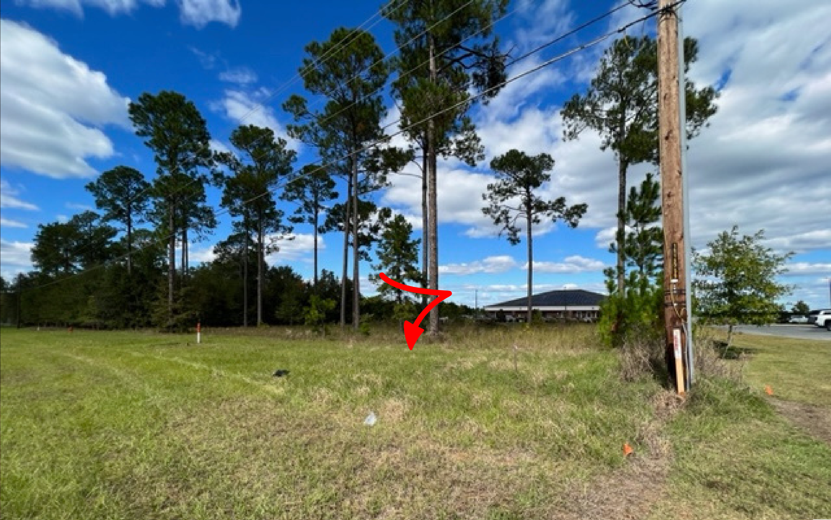
Looking at property from the SE corner